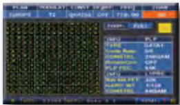
DVB-T2 normal constellation with 256 QAM modulation