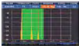
ECHO MEASUREMENT in SFN networks, with impulse response in real time