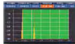
MICRO ECHO measurement in SFN networks, with impulse response in real time