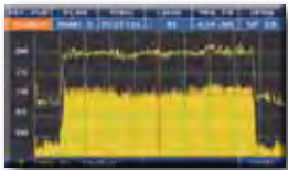
Fast and super-fast spectrum with memory peak. Detects and memorizes all the details for you