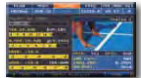
All measurements, pictures and settings on one screen

For technical specifications and product cross-reference, see pages 25 and 26.