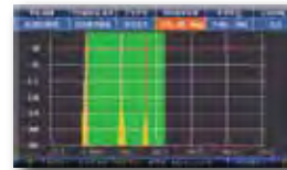
Impulse response in real time (ECHO & MICRO ECHO measurement in "SFN" networks) See page 22