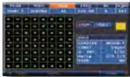
Constell. DVB-S2 = 8PSK, T & T2 = COFDM, C = QAM and all the modulation parameters